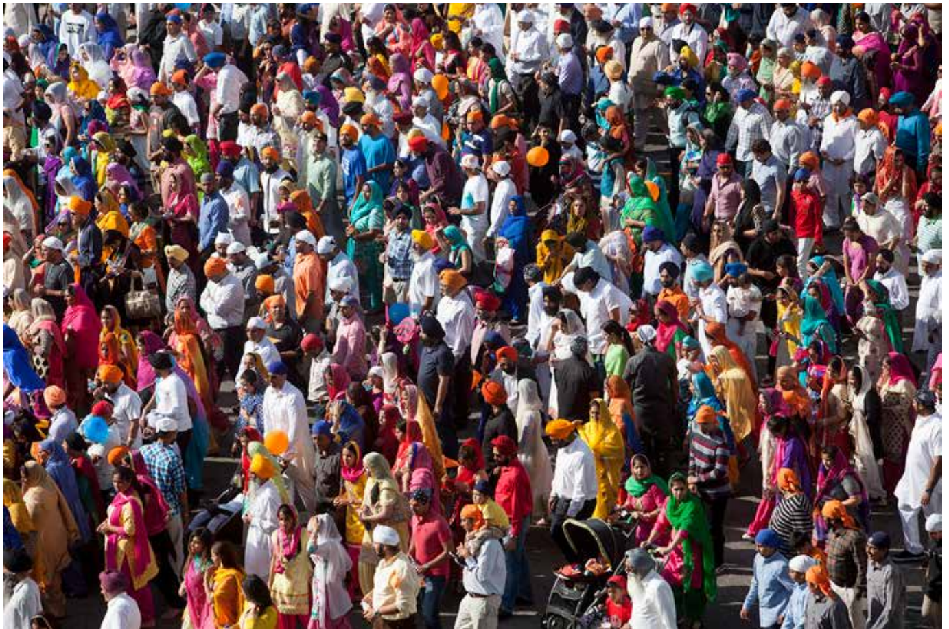
Downtown Los Angeles, 2015

Los Angeles Center of Photography (formerly The Julia Dean Photo Workshops) 1515 Wilcox Ave. Los Angeles, CA 90028