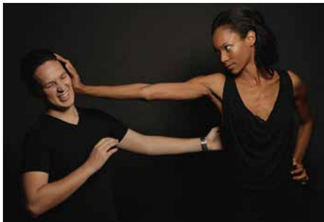
© Michele Blackwell, recent "Crash Flash" student

This class is for students who have taken Crash Flash 1: On Camera Flash and want to learn how to light more beautifully by getting the flash off camera. Julia will demonstrate how to use a single flash or multiple flashes off camera to achieve a beautiful "quality" of light. We will use light stands, umbrellas, and gels—in the studio and on location, in both the TTL mode and in manual mode with wireless technology. There will be a four-hour shoot in the afternoon with models to put all the techniques into play. At the end of the day, a critique will take place to view students' work.